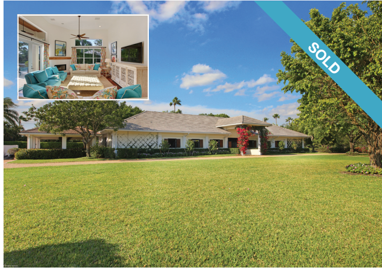
SADDLE TRAIL | $6,870,000

Private farm in the Heart of Wellington | 3/4 bedroom, 4 bath | modern finishes balanced with a warm and welcoming aesthetic | raised ceilings, fireplace, granite countertops, hardwood floors, impact glass, and an expansive master suite | 3-car garage and a pool | 14-stall center aisle barn with breathtaking wood details