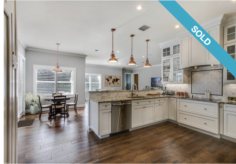
LAKEFIELD WEST | $799,000

Private farm in the Heart of Wellington | 3/4 bedroom, 4 bath | modern finishes balanced with a warm and welcoming aesthetic | raised ceilings, fireplace, granite countertops, hardwood floors, impact glass, and an expansive master suite | 3-car garage and a pool | 14-stall center aisle barn with breathtaking wood details