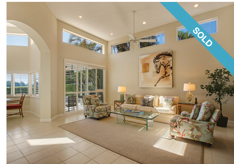
CHUKKER COVE | $648,000

Custom home on a quiet cul-de-sac alongside a canal | 5 bedroom, 4 bath | in-law/guest apartment with a full kitchen and living area | stunning sunset views | screened patio | summer kitchen | heated saltwater pool and spa