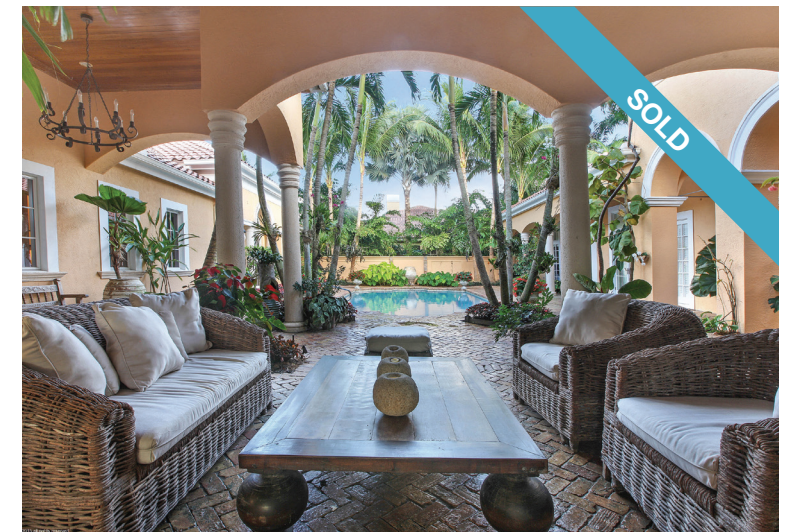
MIZNER ESTATES | $2,200,000

Bright, comfortable, and relaxing 3 bedroom, 3 bath home in Palm Beach Polo & Country Club | traditional tile floors throughout | expansive patio centered around a pool with waterfront and golf course views | open floor plan | raised ceilings and large windows | kitchen features granite countertops, a stone backsplash, and stainless steel appliances