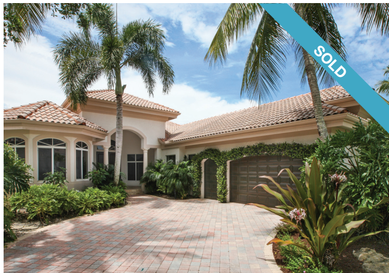
BENT CYPRESS | $975,000

Incredible 10-acre farm | 12-stall center-aisle stable, complete with the finest amenities | a short hack from Palm Beach International Equestrian Center | spacious owner's lounge with full kitchen and 2.5 bathrooms | large grand prix field | new ring with top-grade fiber footing