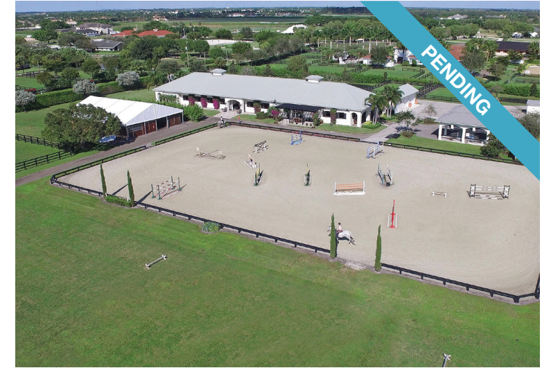
PALM BEACH POINT EAST | $6,700,000

Stunning chateau-inspired estate on 5.44 acres | 3 bedrooms, 4 baths | marble and hardwood floors | theatre room | custom kitchen with Viking gas stove | large covered lanai with a summer kitchen and an infinity pool | 5 turn-out paddocks | 120'x230' all-weather Riso arena | hot walker | fully-equipped 12-stall stable with a new storage building