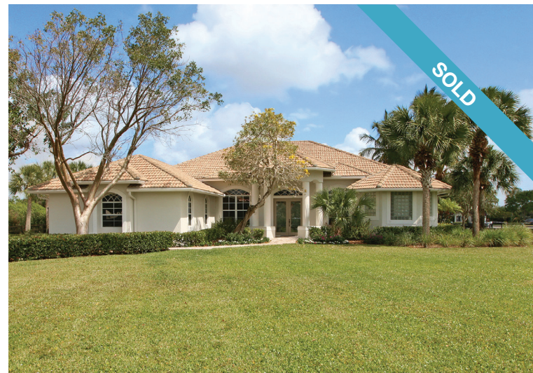
AERO CLUB | $949,000

Private tropical escape with sunset views | 4 bedroom, 4.5 bath estate in Palm Beach Polo & Country Club | stunning lakeside pool | gourmet kitchen with double ovens | gas burning fireplace and a full summer kitchen