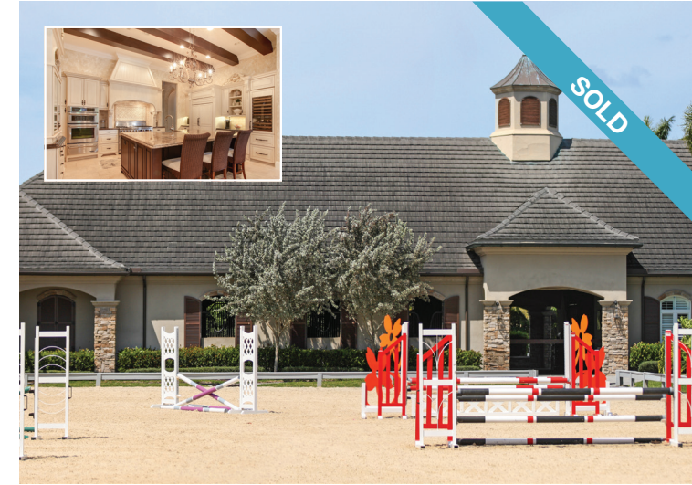
PALM BEACH POINT | $6,950,000

Private gated community | 4 bedroom, 4 bath | 3-car garage | hardwood floors throughout | striking gourmet kitchen | custom stone detailing | summer kitchen and outdoor pool with views overlooking the 18th fairway of The Wanderers Club Golf Course